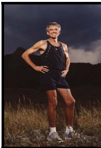
OLYMPIC GOLD MEDALIST FRANK SHORTER