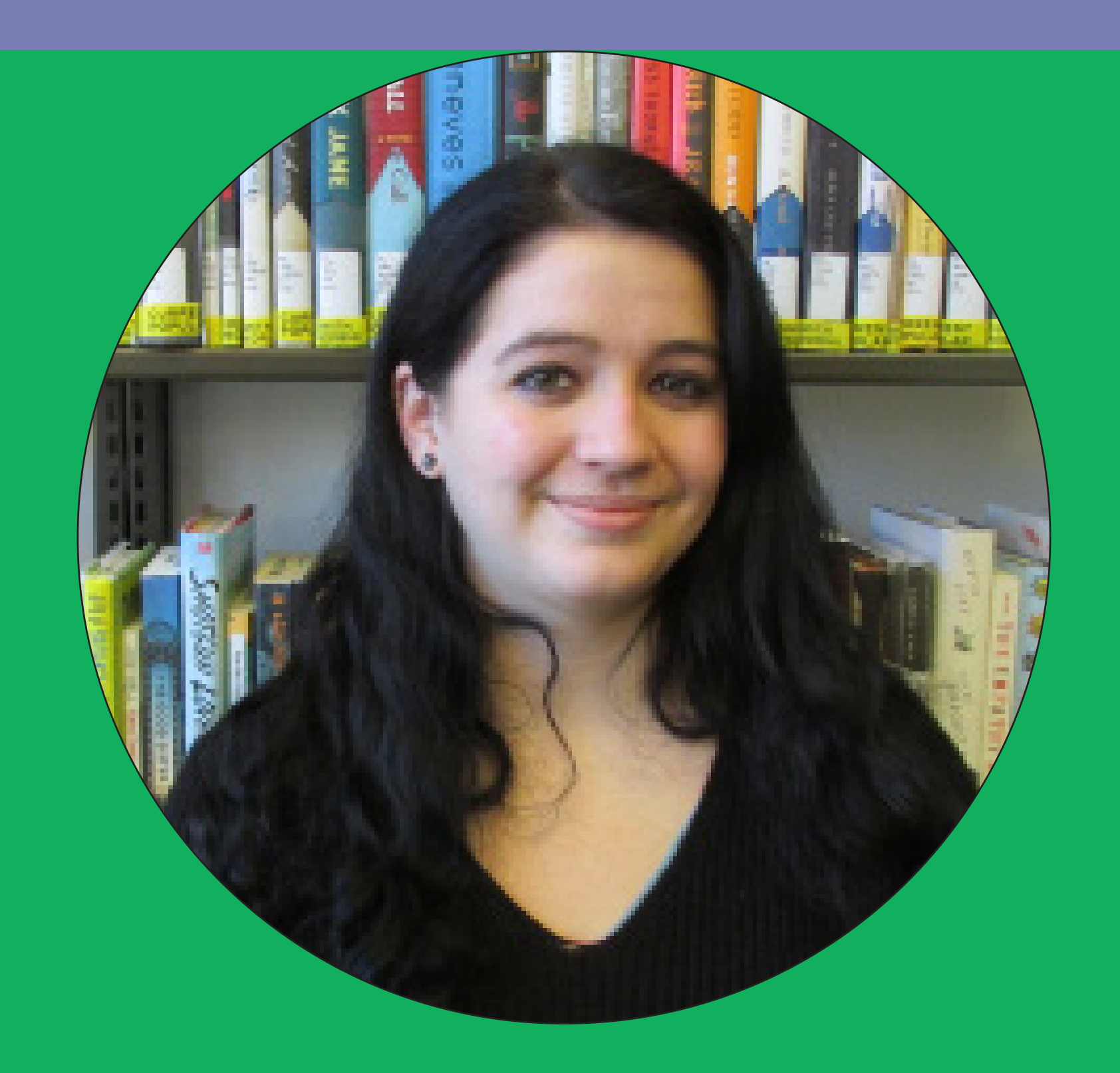
Classics Research Interests: Ancient History, Psychology, Art History, Literature