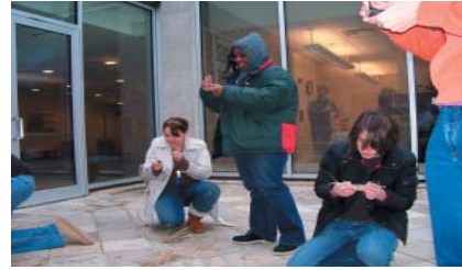
Students in Evolution of Technology striking sparks with flint and steel.

Raging Cow Atlatl Competition April 22, 2006 Grinnell Campus