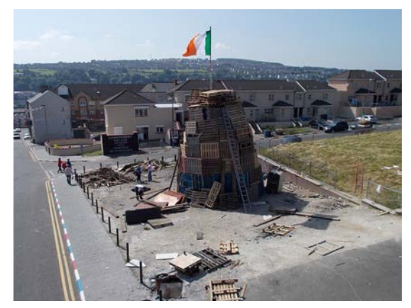
Bonfire preparation in a unionist neighborhood. The Irish Republic flag will be burned